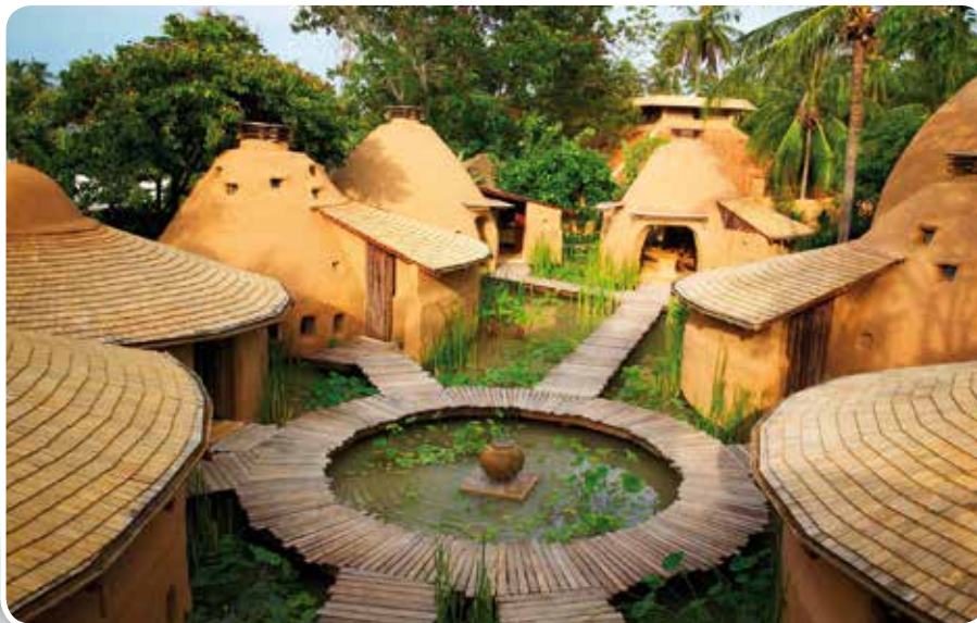
Artisans from the local community built the Six Senses Earth Spa in Hua Hin, Thailand. Traditional building materials and methods, with modern facilities, were used throughout